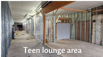
Teen lounge area