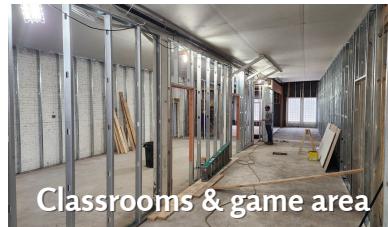
Classrooms & game area