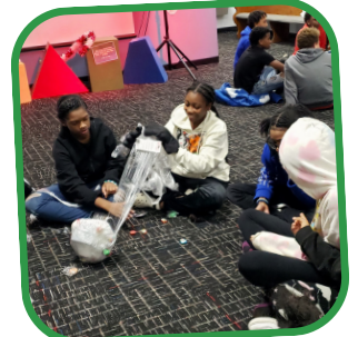
Racing to unwrap a Saran Wrap ball with prizes inside while wearing winter gloves is more difficult than you think!