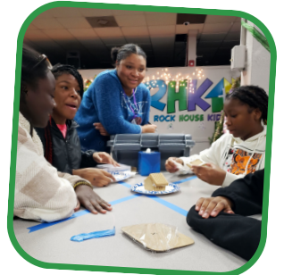
The hardest part of making gingerbread houses is NOT eating the decorations.