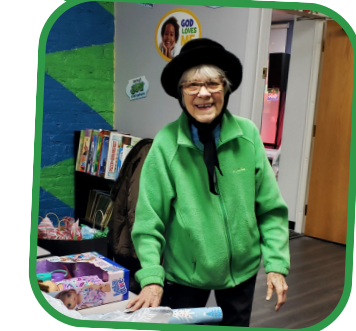
Nearly 70 volunteers came out to wrap presents at our "Annual Wrapping Party".