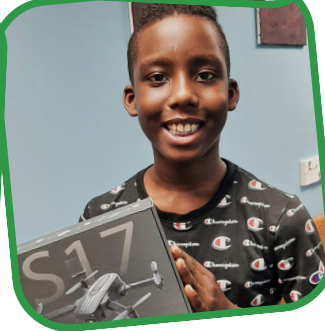
After all the other activities are over, it's time to open presents. Nothing compares to the looks on their faces as they light up and exclaim, "It's just what I wanted!"