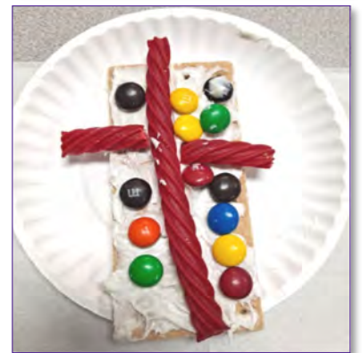
Creations from Rock House Kids imagination and perspectives