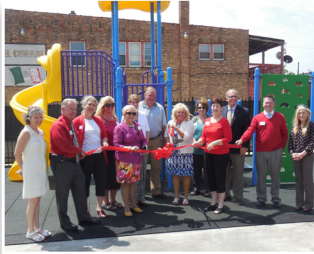
Ribbon Cutting 06.20.16

Rock House Kids is able to provide an outside safe and secure playground! Through the years, we had placed an outdoor portable basketball hoop for the kids to use but we found neighborhood pedophiles harassed them. After we became aware adults were exposing themselves to the kids, it was imperative we secured their safety. We decided to take down the portable hoop. Shortly after this, we started raising money and received help to get a fence around the parking lot so as to convert it into a safe play area. You can only imagine the excitement from the kids! Big eyes, laughter, and squeals of joy